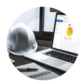
Reduce Energy Usage